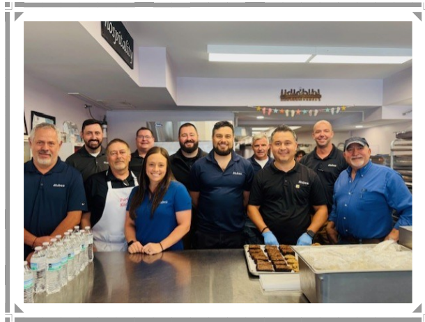
Mubea Employees Serve Picnic Lunch at Parish Kitchen

On May 29, a group of Mubea employees greeted guests and served lunch. In addition to volunteering their time, the company generously donated ingredients for a delicious picnic-style meal, including bratwursts, hot dogs, soda, and ice cream treats—enough to feed the more than 150 guests that dined at Parish Kitchen that day.