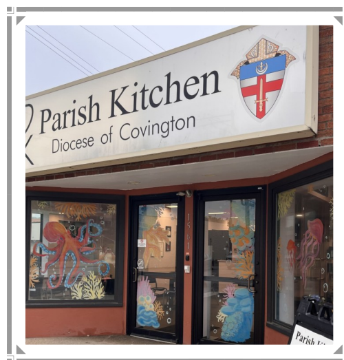
Window Art at Parish Kitchen